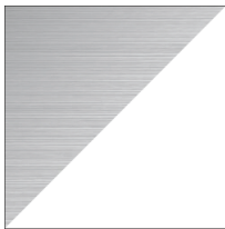
CD10262/9/S+MW Silver & Matte White