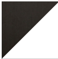
CD10035/9/MBK+MW Matte Black & Matte White