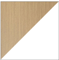
CD10263/9/BB+MW Burnished Brass & Matte White