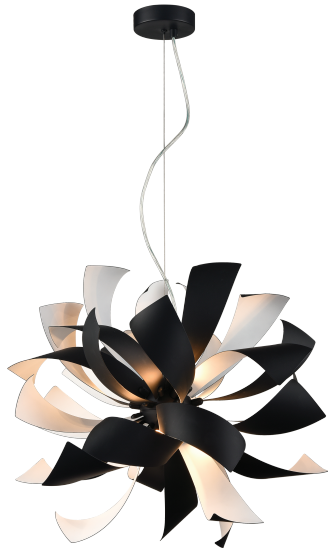
MBK+AGB image not available at the moment